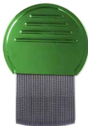
Head lice comb

You can buy a good head lice comb at the pharmacist's. This comb has very fine, angular teeth that are very close together and do not bend.