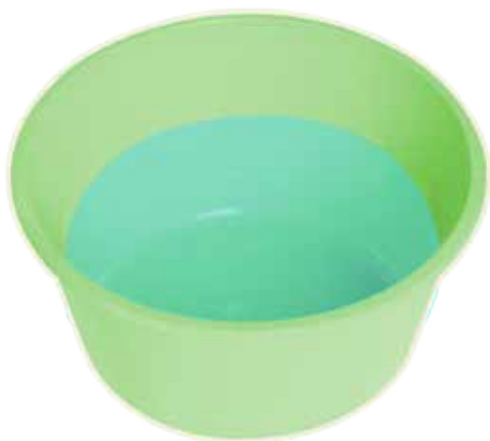
Bowl of lukewarm water

You can buy a good head lice comb at the pharmacist's. This comb has very fine, angular teeth that are very close together and do not bend.