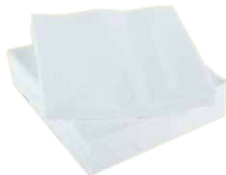
White napkins or kitchen roll