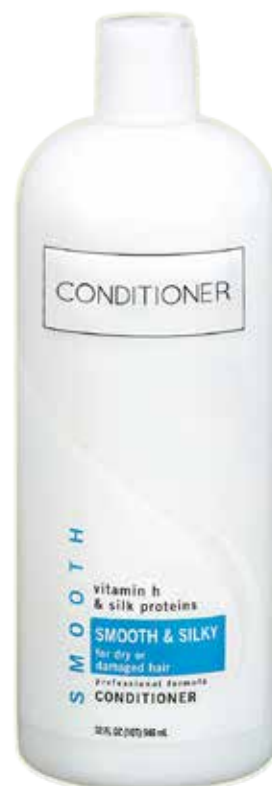
Cream rinse, conditioner or balsam solution